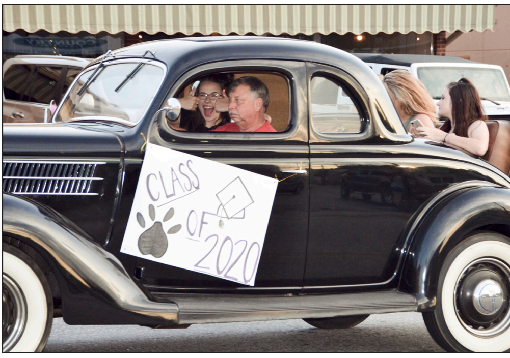
Union County High held a unique drive-in graduation for seniors May 22, which included a procession through town.