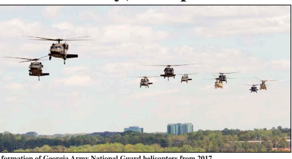
A formation of Georgia Army National Guard helicopters from 2017.